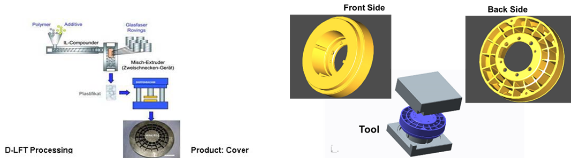
Fig 2. D-LFT moulding (left) and post processing of cover parts (right)

in simple designs without undercuts. The required undercuts next to the impeller are milled in an additional post processing step (s. Fig. 2).